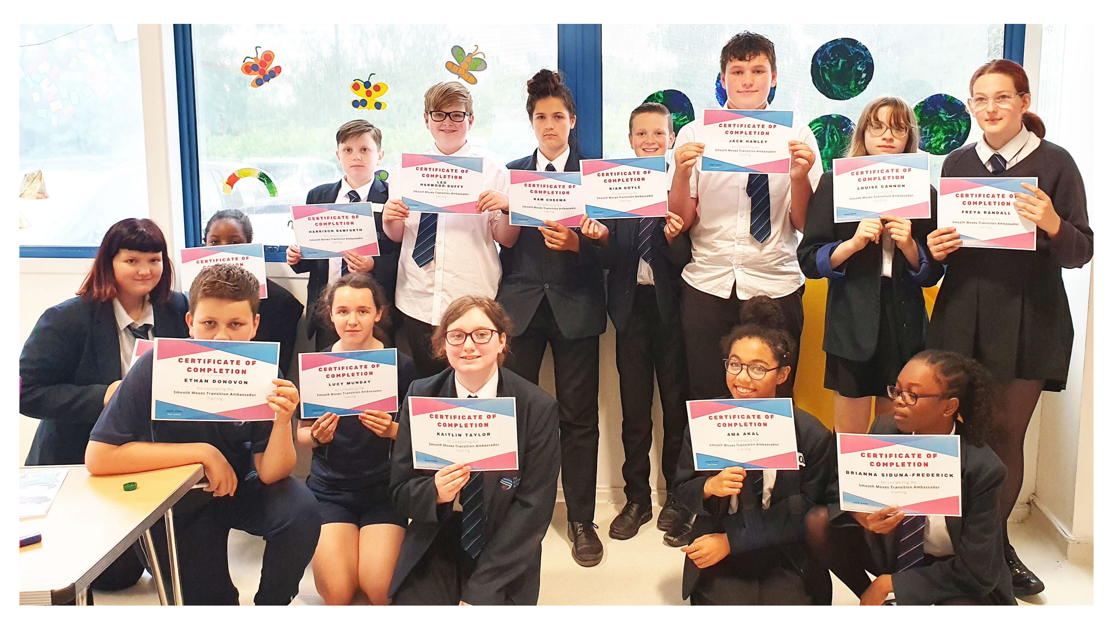
Film 5 Transition Ambassadors 2022